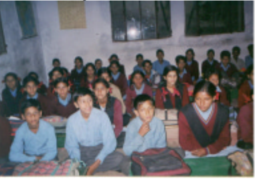
SIDH, Uttaranchal: The journey from teaching to learning,