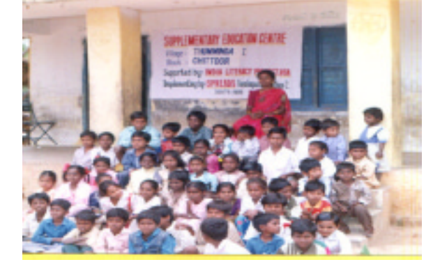
SPREADS, Chittor, Andhra Pradesh: Supplemental education center