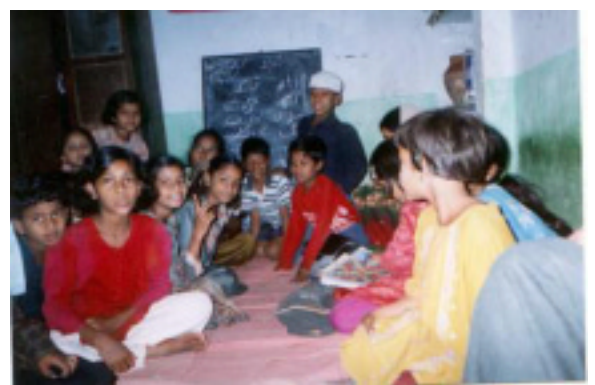
Mahita, Old Hyderabad, Andhra Pradesh: Non-formal education center and Balwadis.