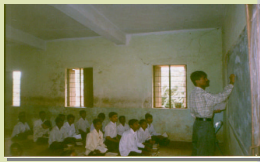
Kamtana High School, the hub of the JEEVANA KALIKE PROJECT in Aralu, Karnataka

To this end, the single high school in Kamtana serves as the focal point with primary and schools middle in the surrounding 6 villages serving as feeders. The project has now moved to a second phase where the focus is on strengthening the community processes, ensuring smooth functioning of the school development and monitoring committees. The initiative touches nearly 2220 students.