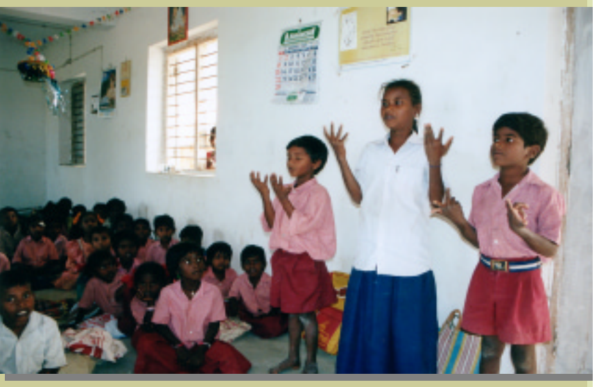
Children at the residential bridge school run by TEA TRUST

Children of migrant laborers who spend 6-8 months away from home are the focal point of this project. Full-time bridge courses for 50 children, supplemental education centers benefiting up to 180 children and teaching support given to 2 primary schools in the area are all a part of this effort with the ultimate aim being to eliminate child labor from the dangerous brick kiln industry that thrives in this area.