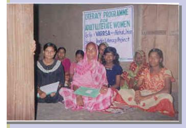
Vomen's Adult Literacy program at VARRSA, Bhadrak, Orissa

ILP has been funding VARRSA's "Literacy for Empowerment of Rural Women" project since early 2002. The objectives of this project include facilitating 1000 women to become functionally literate, strengthening self-help groups for these women and encouraging their children, especially girls in the age group of 5-14, to get primary education and ensuring their retention.